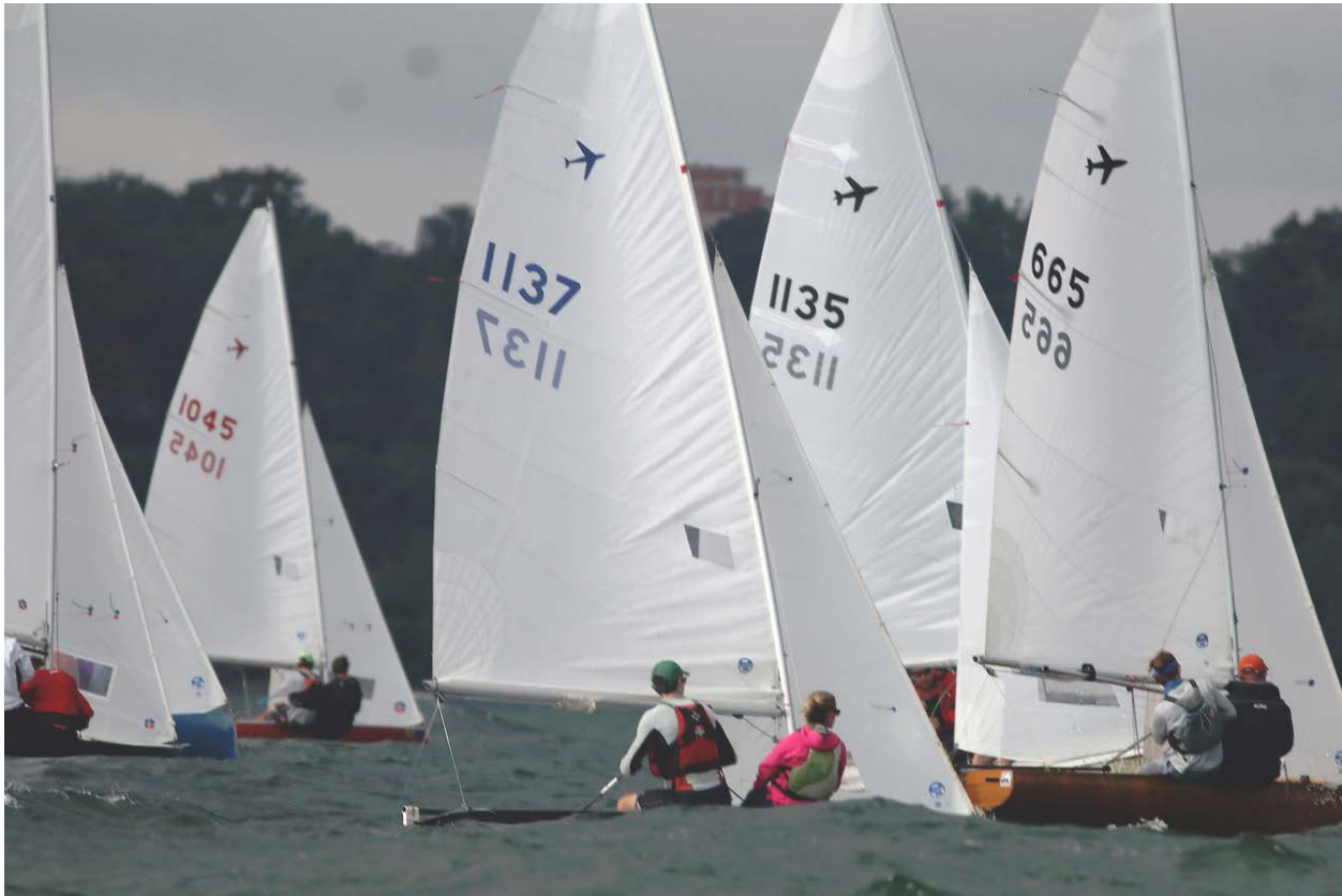
Above: Team Bark (#1137) and Gemperline (#665) look for an opening upwind on Day 3 of the 2017 Jet-14 Nationals at Edgewater Yacht Club.

Brent Barbehenn (Cooper River Yacht Club, NJ) and Sara Paisley won the 63 rd Jet-14 Nationals in dominant fashion at Edgewater Yacht Club near Cleveland, OH in a variety of conditions. The first two days featured mostly light to moderate breezes out of the south, providing light chop and pleasant racing. Racing was interrupted on Day 2 by an ominous looking shelf cloud and a