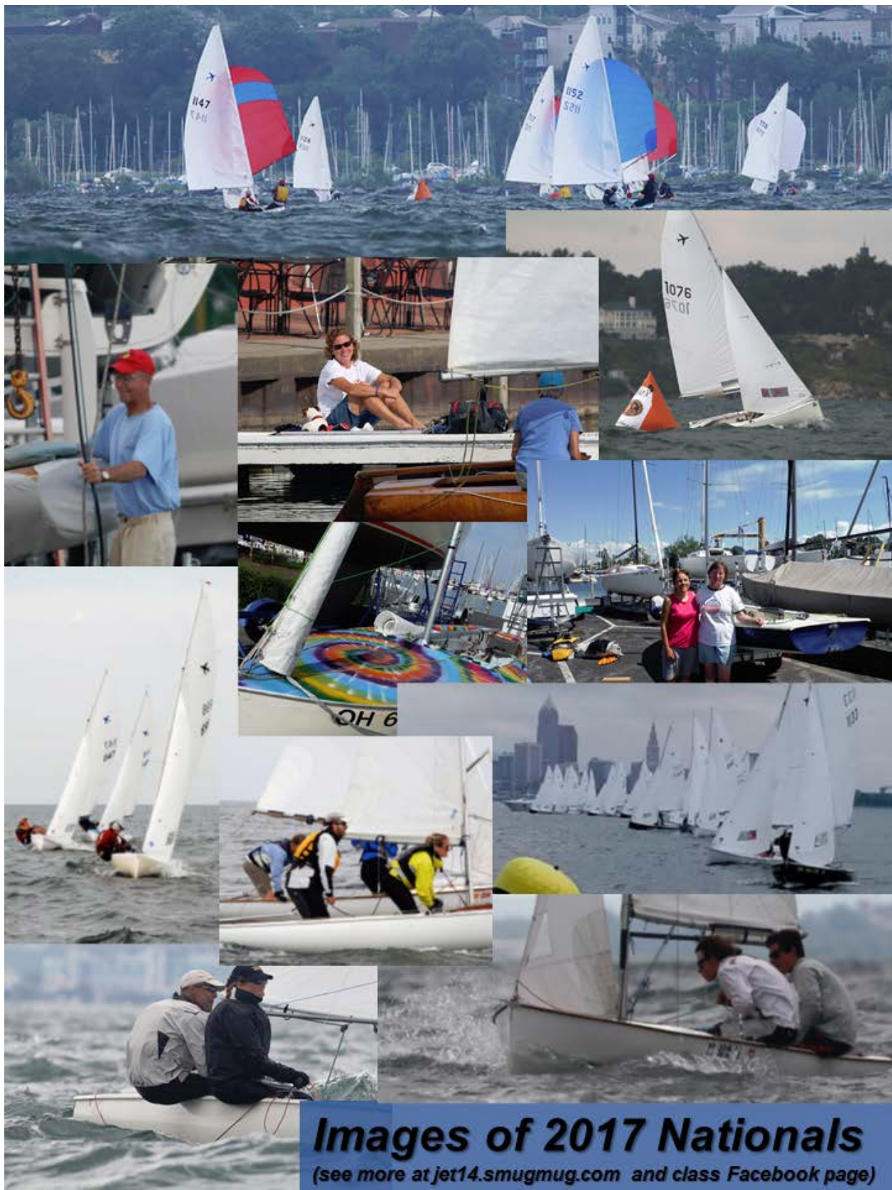
Images of 2017 Nationals (see more at jet14.smugmug.com and class Facebook page)