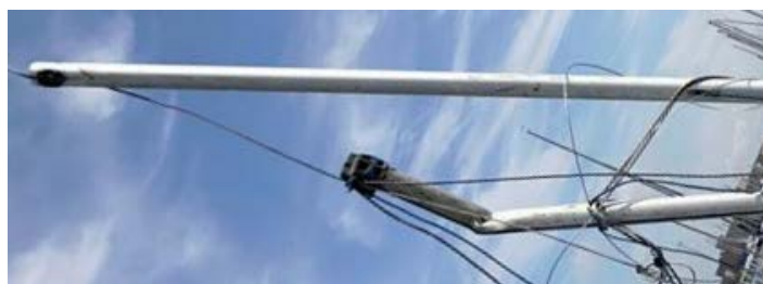
Left: Mast section for #1130 after Saturday's race