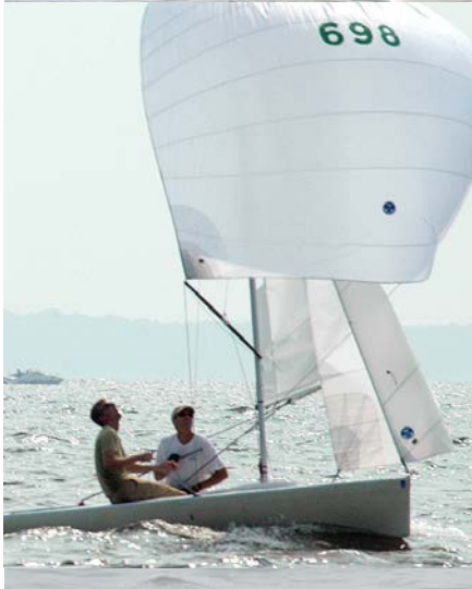
Clockwise from top left: Women's Nat'ls; Thursday racing; Joudrey Boys roll-tacking; Pool Party; Barbehenn/Stock flying the chute. Background: Saturday' Race 9 in the breeze.